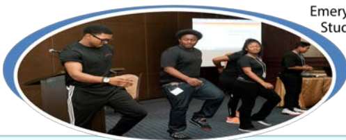
Emery CI and Thistletown CI Students lead the Physical Activity Break