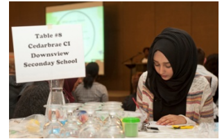
Students at the First Annual Mental Health and Well-Being Secondary School Student Symposium